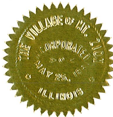
Dawn Reynolds, Village Clerk